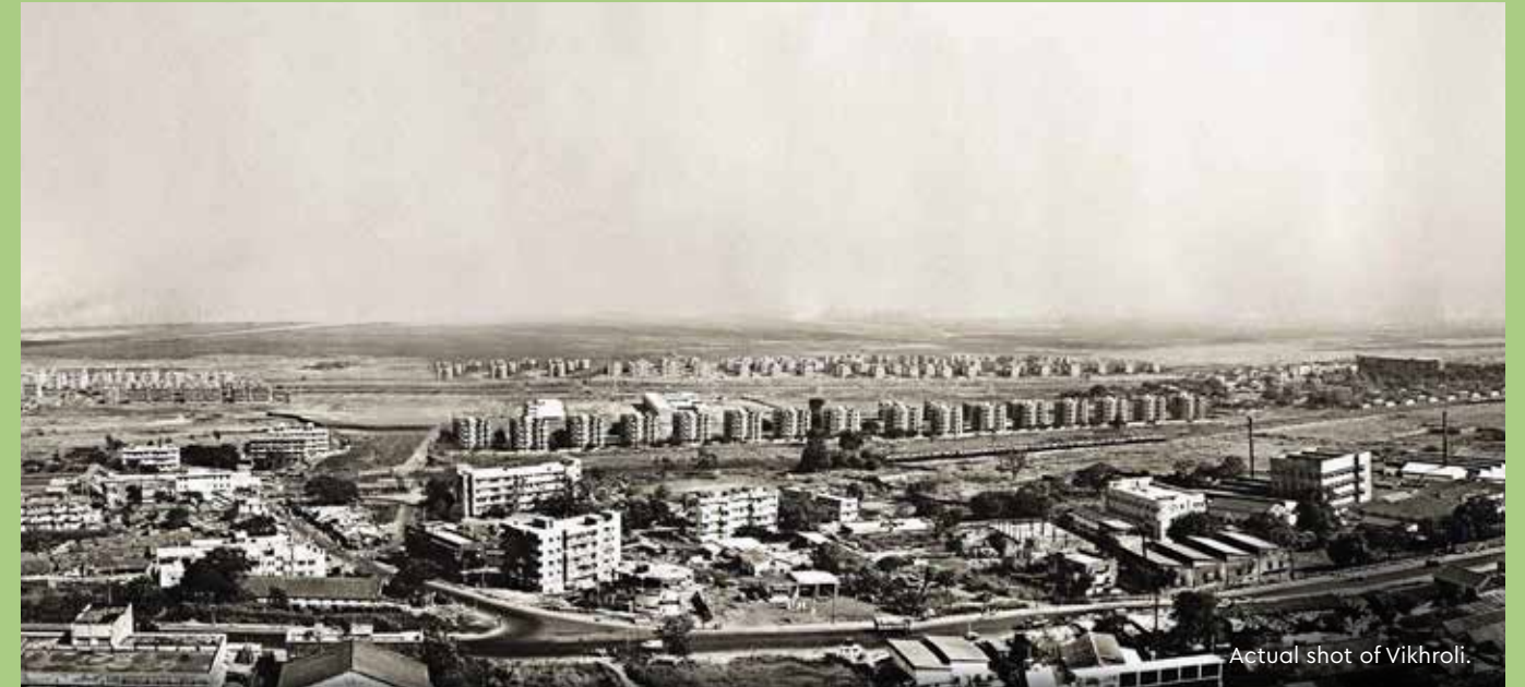
Actual shot of Vikhroli.