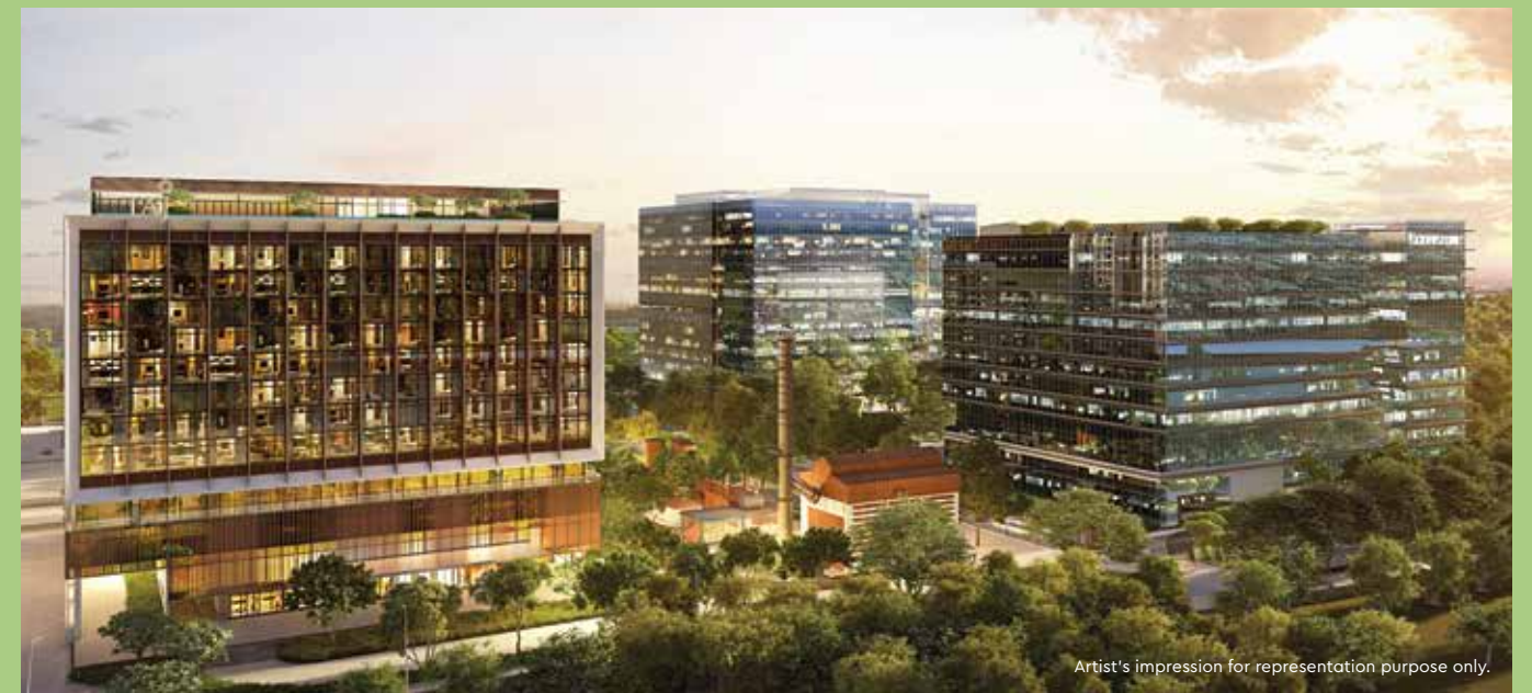
Artist's impression for representation purpose only.

In the 1940s, the founding fathers of the Godrej family developed a whole industrial township in Vikhroli with a remarkable vision to shape a new world in Mumbai. Today, that vision has manifested into reality with thousands of trees greeting you every morning while you are cradled in contemporary comforts amidst nature. Here, a marvellous ecosystem thrives alongside the finest social infrastructure and residential developments, set amidst nature's rich natural canvas.